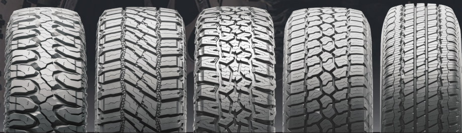
M/T-02 X/T A/T Pro A/T R H/T